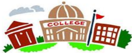
Higher Education Institution