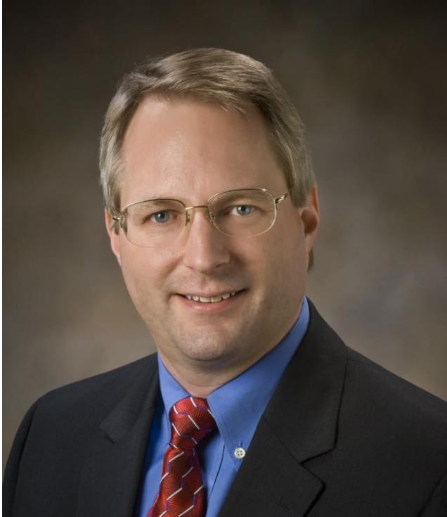
Joseph Slater College of Engineering